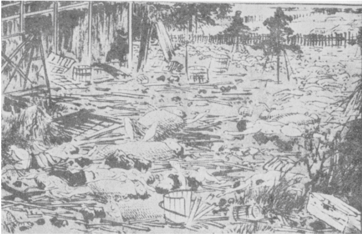
Figure 1. Devastated region: Kamaishi, Iwate [1]